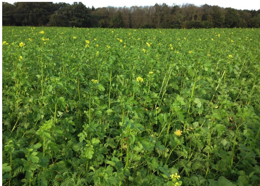
The cover crop we grew at home before spring beans