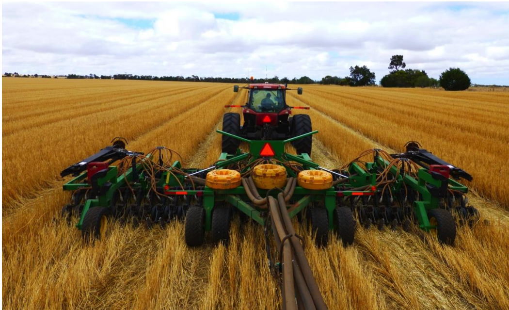
Tom Robinson in South Australia planting cover crops into barley stubble

The picture below shows Tom Robinson planting cover crops into barley stubble.