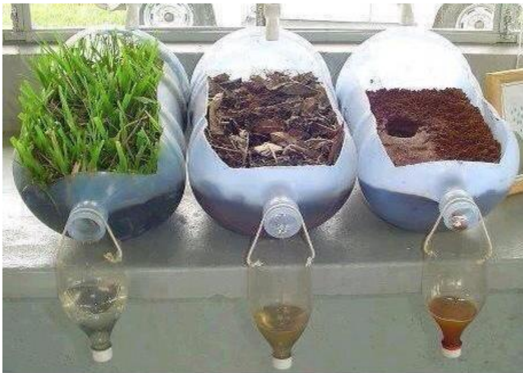
Note colour of water draining away from the container growing plants as opposed to bare ground

It shows that having plants growing (and therefore having healthy living roots) keeps the soil bound together and far less likely to erode or wash. The roots also aerate the soil, which adds to the "honeycomb effect" that all the wormholes create.