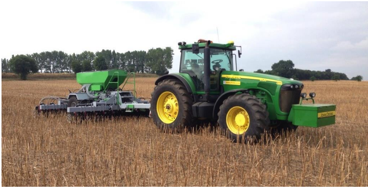
Here is the result of my Nuffield Farming Scholarship. No-till cover crops planted after oilseed rape on the 21st July 2014.