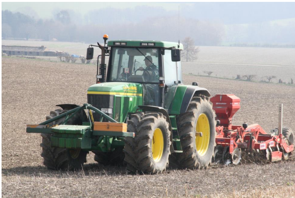
Our previous cultivation practice using a Sumo Trio cultivator

The aim of our post-harvest cultivation was to encourage a germination of any weed seeds and also any seeds and chaff that were missed or dropped by the combine. We also took this opportunity to try and level the fields and mix soil with the chopped straw thinking that this was best for rapid decomposition and the following crop. We had a seeder fitted to the Sumo Trio, which allowed us to plant oilseed rape (canola to my Australian and South American friends) directly into the soil in one pass.