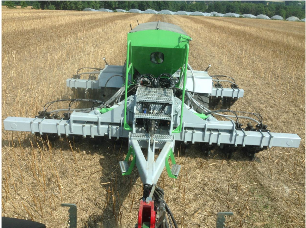
The new drill in action planting cover crops after oilseed rape.

All stubbles will be chopped and straw retained as mulch on the surface to build SOM, feed soil biology and protect it from the elements.