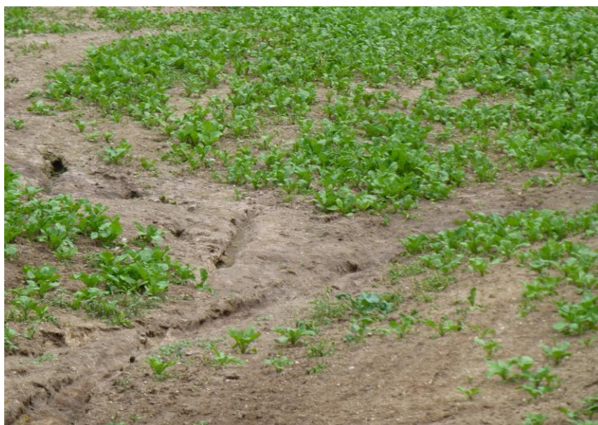
This picture shows an eroded channel in a field in New Zealand

Iguassu Falls were a red colour years ago when conventional agriculture (with cultivation) was practised. Now that the surrounding region of Argentina, Paraguay and Brazil has almost entirely embraced no –tillage the falls run a beautiful clear colour.