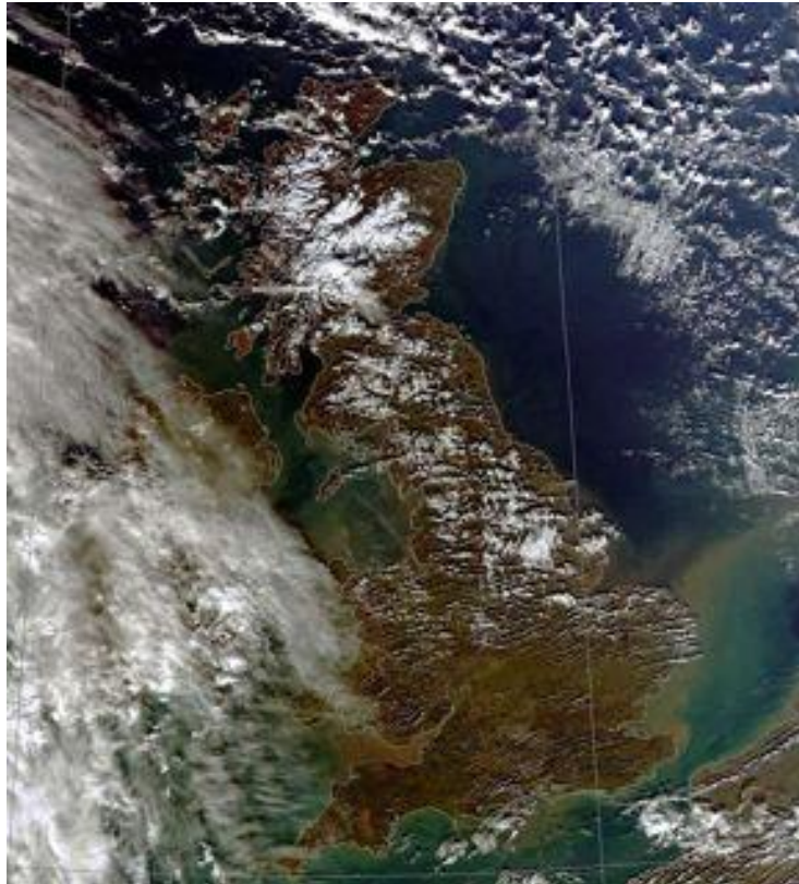
The image above really got me thinking and was released during the floods in the UK of 2013/14. The soil erosion going out through the river estuaries is really quite worrying