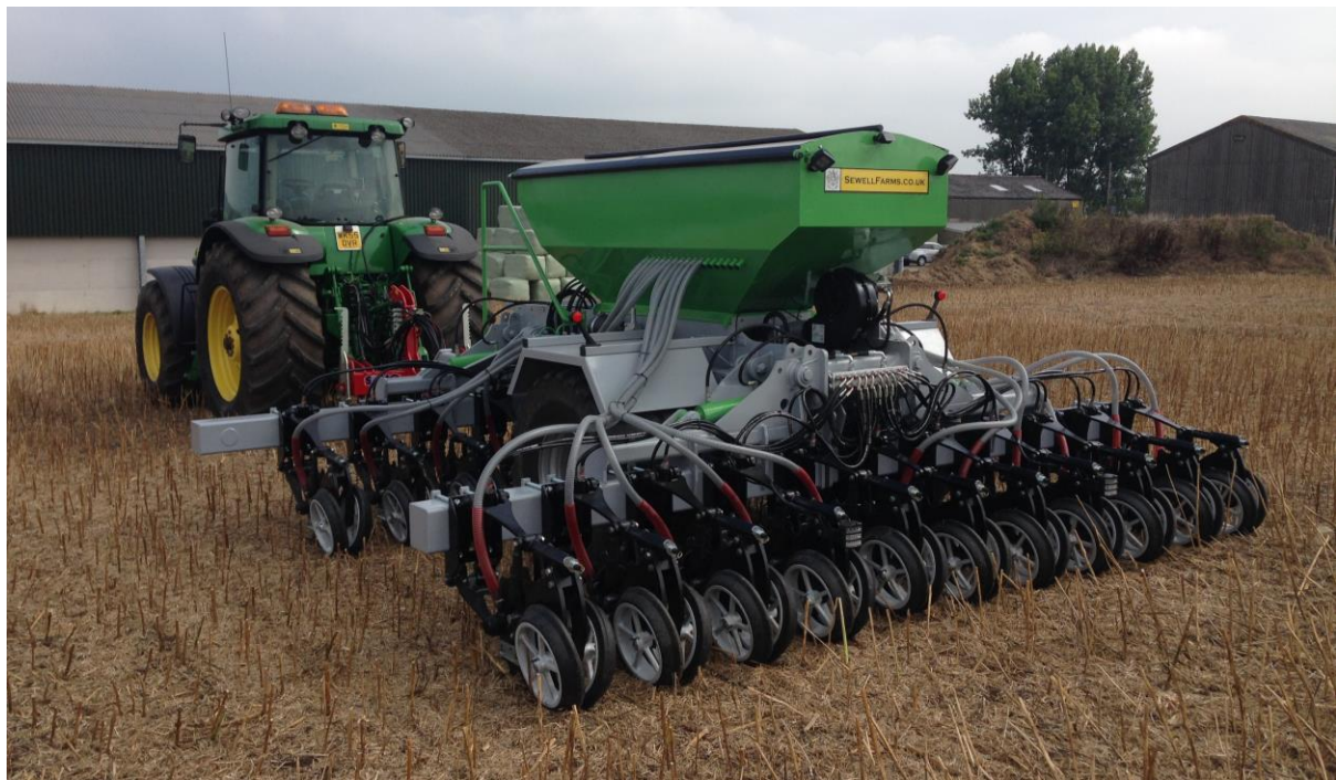
First day out with the new tractor and cross slot drill planting cover crops into oilseed rape stubbles

I have always felt that there are three main machines on an arable farm that need to be right and they are the sprayer, combine and drill. We now have those three machines at our disposal and I feel they are right for our business giving us the capacity to get our own work done and also some spare capacity for expansion.