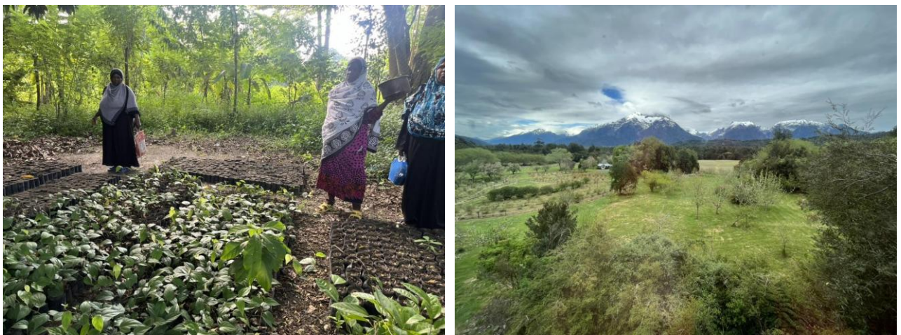
Figure 7&8: Left: Community Forest Pemba Tree Nursery run by local women. Right: Buffer Farms bordering Pumalin National Park in Chile.

Economic opportunities were also evident when a farming business created multiple diverse income streams. Many different projects highlighted the positive economic transformation of their business, when they moved away from being solely reliant on one income stream.