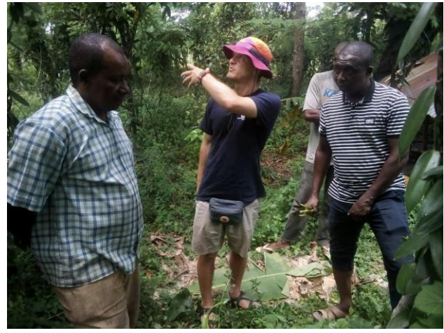
Figure 21&22: Author's own, Left & Right: With community Forest Pemba visiting various farmers from vegetables (left image) and spice (right image).

In Bavaria, Germany, to start the transition to coexistence with beavers across the whole region, it was agreed the best way was the formation of volunteer beaver wardens. Now nearly every village or town will have a beaver warden, who is the point of contact to help deal with a situation, such as an inappropriate dam, injured animal or crop damage.