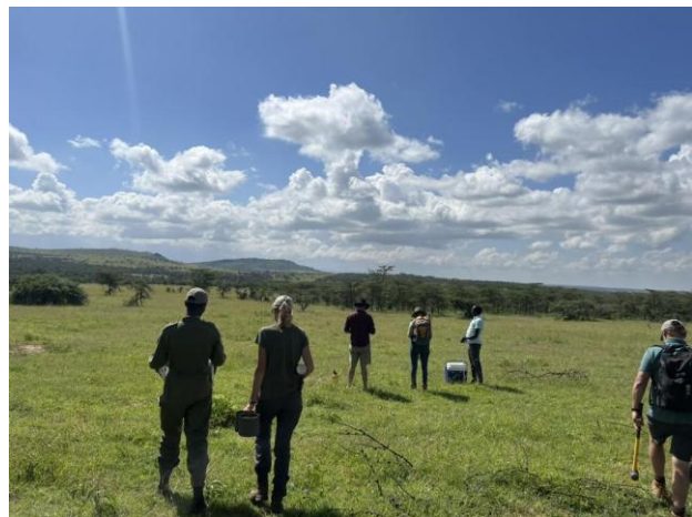
Figure 11&12: Author's own, Left: View of Fundo Pangeuilemu where Holistic Grazing is practiced Right: Monitoring with True Range LTD and Savoury Institute in Northern Kenya

Holistic grazing was again being deployed near Coyhaique, Chile, on Fundo Pangeuilemu. Here mixed stocking was being utilised to help deliver soil health alongside nature recovery. Since shifting to their holistic grazing strategy, they are seeing increased organic matter levels of their soil. This in turn, has delivered greater grass growth and regeneration of vegetation, alongside positively impacting their meat production and environmental outcomes.