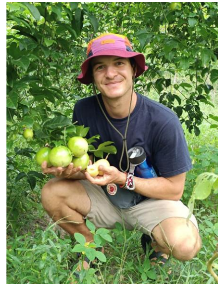
Figure 1: Myself On Pemba Island on a passionfruit farm

The study tour made me realise the complexities that we face within the UK. Space is premium on our small island, something that other countries have in vast quantities. Cultures and societies are often also not considered to a high degree in the UK. It also highlighted the incredible opportunities and progress we are making. So often before my travels, I was told, you will go looking for answers but often you already have them and will be giving the answers to others. This soon became clear and gave me an increased confidence in my own knowledge.