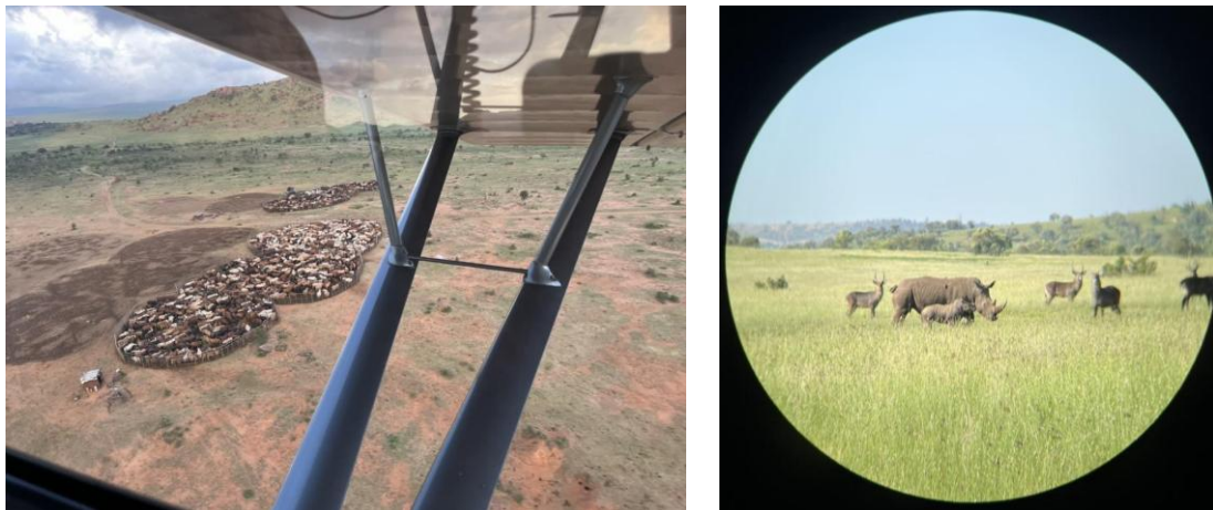
Figure 17&18: Left: View of cattle bomas on Borana Conservancy. Right: White Rhino spotting on Borana Conservancy with Wilson (Head of Rhino monitoring).

However, when choosing a method of restoration that could be replicated in the UK, then Borana's method of utilising domestic stock to deliver the environment for natural flora and fauna is certainly more realistic than that of the Patagonia National Park. This is due to the different pressure we have in the UK from population densities, farming diversity and also social norms for access to the countryside.