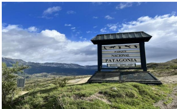
Figure 26 & 27: Author's own, Left: Entrance to Pumalin National Park, Right: Entrance to Patagonia National Park.