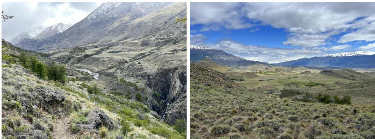
Figure 24& 25: Left & right: View of Patagonia National Park.

This joined up approach of community, farmers and landowners is something that is often missed or not attempted in the UK. However, as shown by the examples above, and in particular the Patagonia Defense Council, this collaboration can bring power to projects and local communities. This greater collaboration could lead to stronger markets and more awareness of farm issues within the marginal areas of the UK landscape.