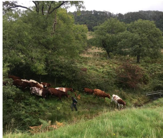
Figure 9&10: Author's own, Left: View of Alladale Wilderness in Northern Scotland. Right: Wilder Gowbarrow moving their herd of Beef Shorthorns.

Closer to home Wilder Gowbarrow (300 acres), demonstrates how again niche markets can help support small scale farmers. Here a mixture of rewilding, natural processes and regenerative agriculture lead the way in Sam and Claire's ambition for showcasing how we can produce food whilst restoring environments. Gowbarrow has used the nature restoration project to create a strong connection to customers in a different way to Alladale, this time through direct retail of their meat. By utilising the products story and connection to nature recovery, the farm is receiving a premium compared to the general market.